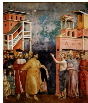
"St. Francis Stands Naked Before God" by Giotto